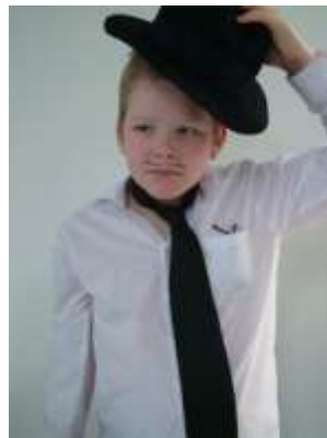
Murder Mystery Dinner at Larch House

reg. charity no.1112734 www.phaseworldwide.org email info@phaseworldwide.org