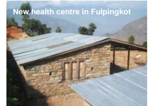
New health centre in Fulpingkot

Our health programmes in the 4 PHASE Worldwide funded villages are progressing well. In Fulpingkot, a new building for the outreach clinic has been completed with funds donated by supporter Maga Kijak, in memory of her Aunt. This building was essential as local houses, with their tiny windows that allow virtually no light in, were not suitable as a health centre. Our health workers had been improvising by curtaining off a veranda, which does not work well for privacy.