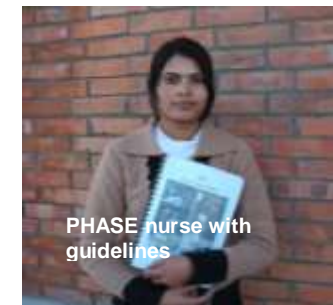
PHASE nurse with guidelines

reg. charity no.1112734 www.phaseworldwide.org email: info@phaseworldwide.org