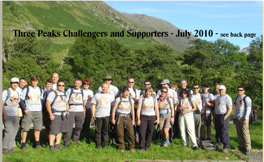
Three Peaks Challengers and Supporters - July 2010 - see back page

PHASE works to support disadvantaged communities in rural Nepal and elsewhere in the world by providing opportunities and encouraging community centred and sustainable development whilst utilising local resources and appropriate technology