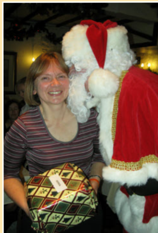
A typical Trustees' Meeting