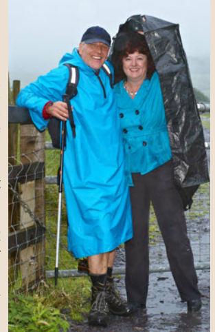
Well done darling! How are your feet?